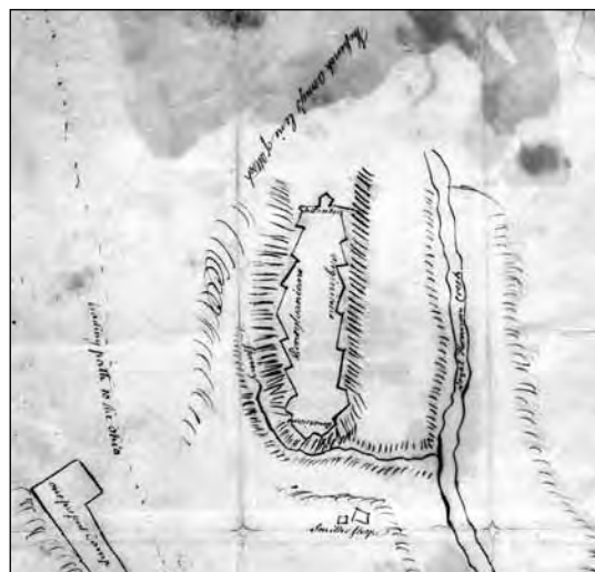
Map of Fort Ligonier drawn in 1758