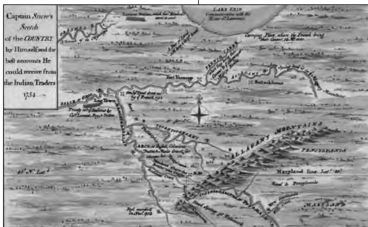
1754 Map of Western Pennsylvania