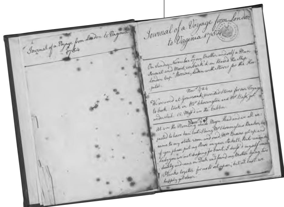
Charlotte Browne's journal